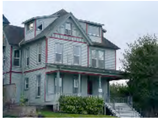
1224 North I Street