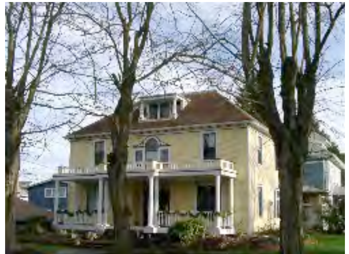
1018 North K Street - See story on page 2